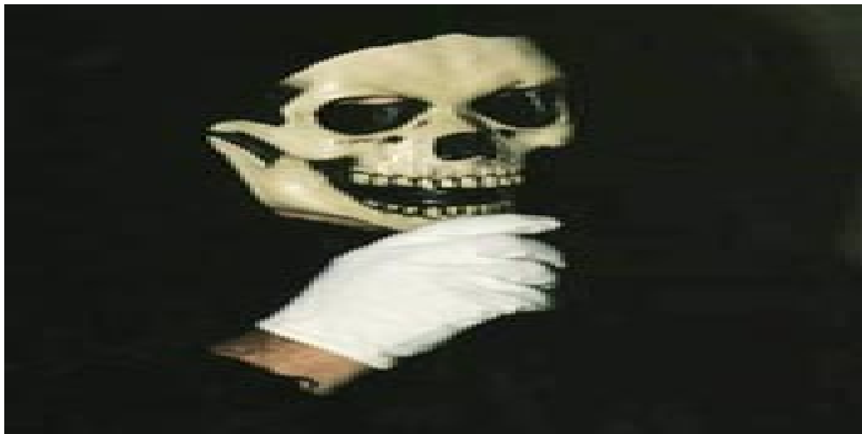
HALLOWEEN COSTUME AT A DEAF SOCIAL CLUB, 1987.